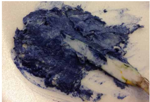
Apply acrylic paint to slurry and mix well.

Slurry has a porridge consistency and is made from a mix of small pieces of clay and water. I keep this in a plastic storage container so I always have some available. This can be used to thicken your acrylic paints and add texture to your art. It can also be stamped into it, make raised stencils or backgrounds. Also, it is easy to tint with just a little bit of acrylic paint.