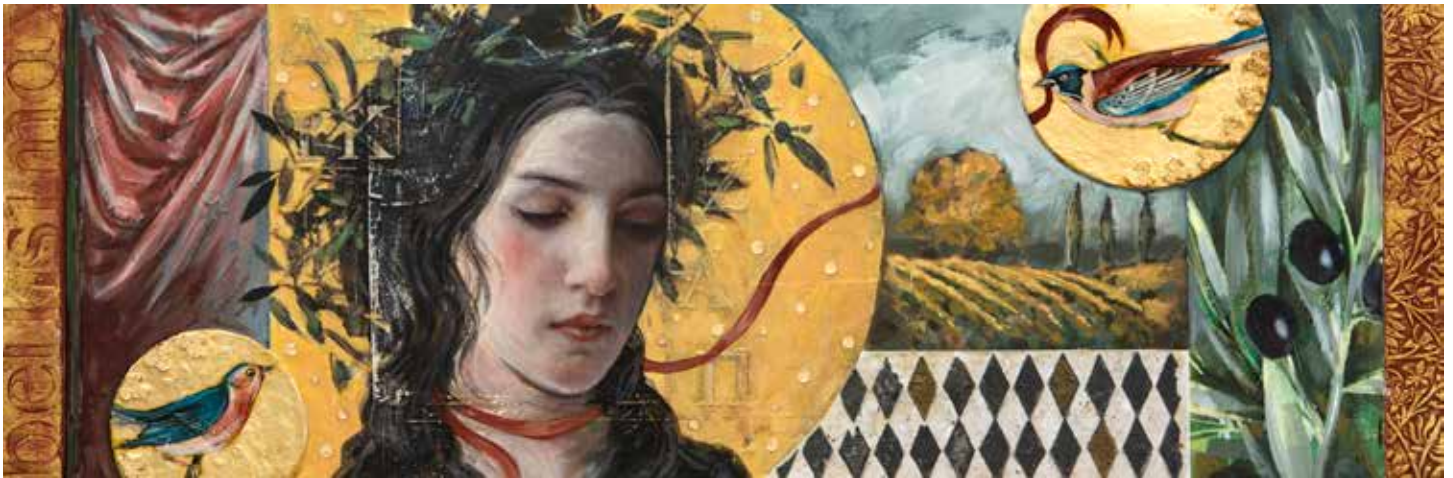
Bellisima, 12" x 36" mixed media on panel