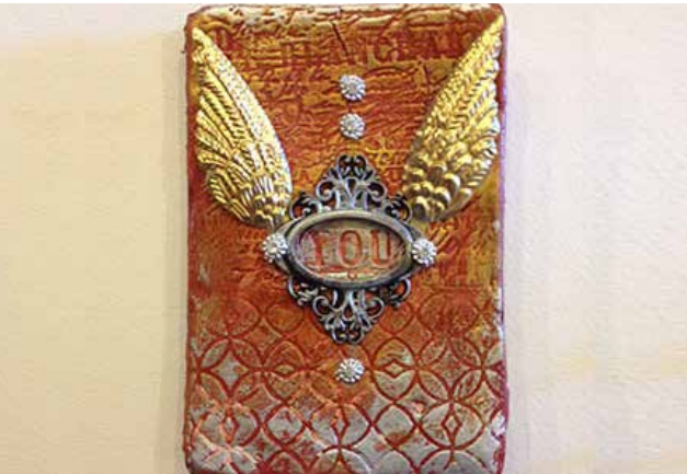
Gold & silver rub on painted, stamped clay.