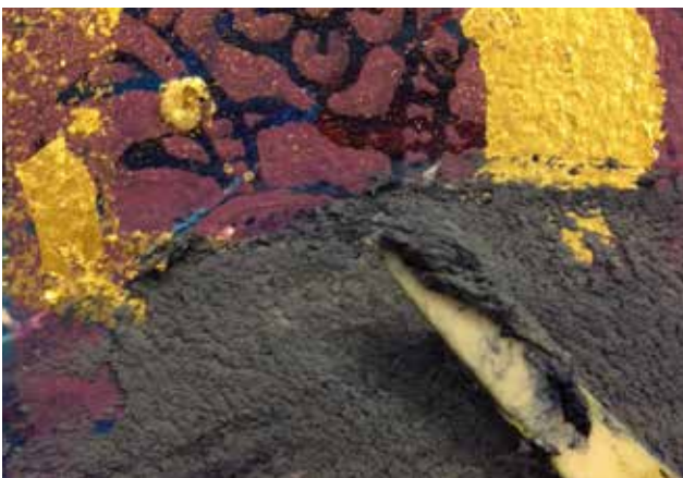
Apply to surface & stamp with bubble wrap. Let dry.