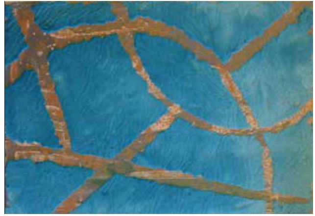
When dry, remove wax paper & scribe into surface.