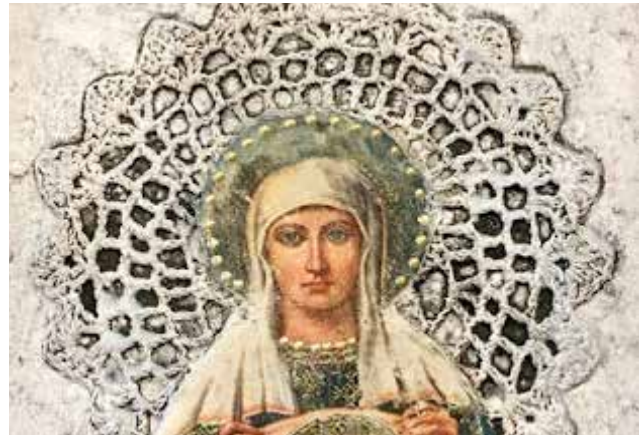
Blender pen transfer applied to clay.