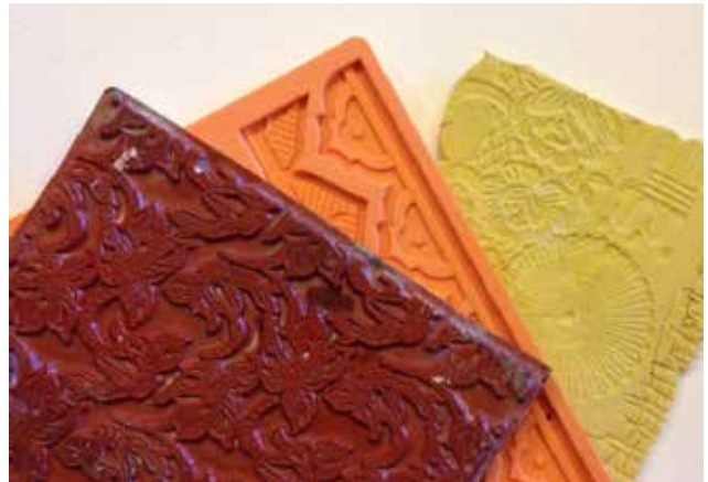
Stamps & texture plates are great for surface interest.

Drying time varies based temperature and humidity for the time of year and also thickness of the clay. Once dry the clay takes paint and surface techniques well. Put unused clay into a sealable plastic bag to keep it moist for future use.