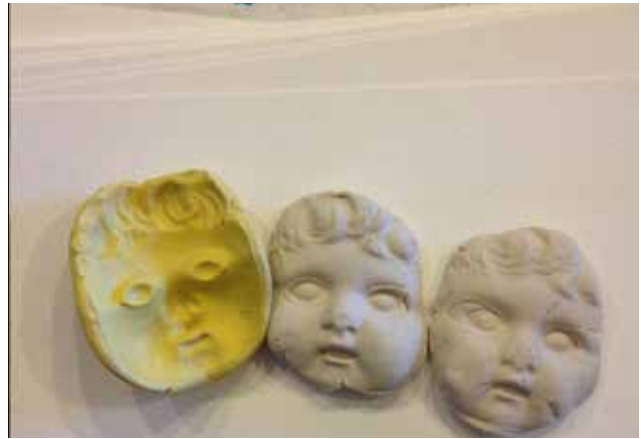
Each cast will look slightly different.