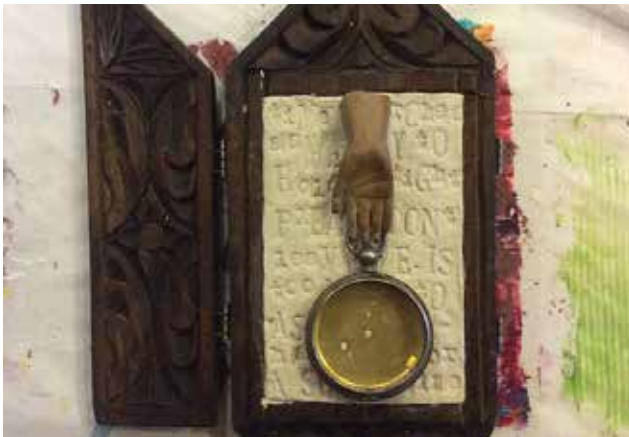
Stamped clay in found frame.