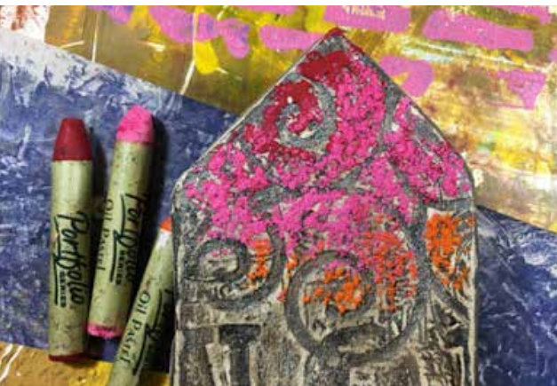
4 Oil pastels applied to painted, stamped clay.