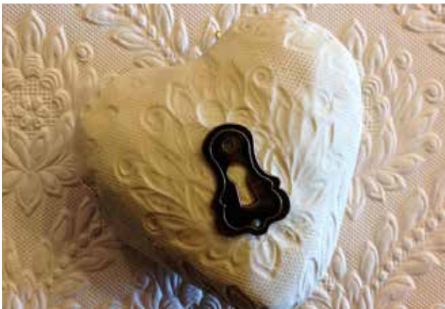
1 Stamped clay over cardboard heart shape.