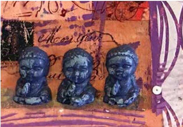
Painted cast objects glued to art with soft gel.