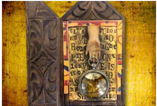
Finished off with paint & collaged objects.