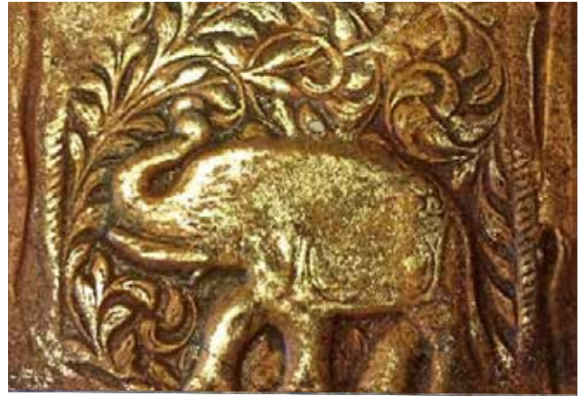
Holographic gold foil applied to stained clay.

Before applying color, I seal the dry clay with polymer medium. This keeps the paint from being absorbed into the surface. When the art is complete, I add a final coat of GAC 200. Again, this has a hardener in it that prevents chipping if it is being handled a lot.