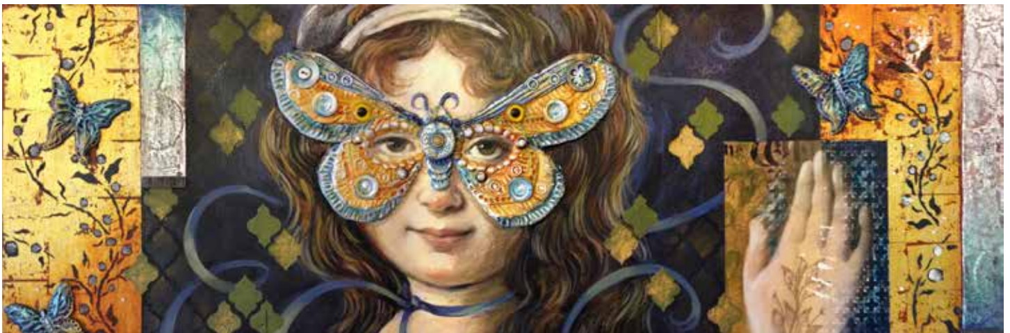
Fly Bye, 12" x 36" mixed media on panel