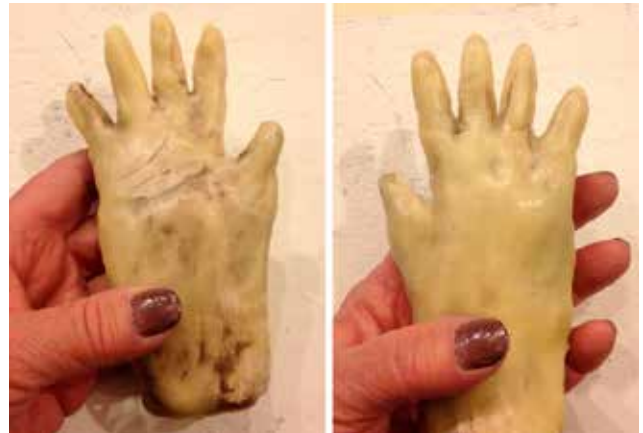
Encaustic wax applied over clay hand & stained.