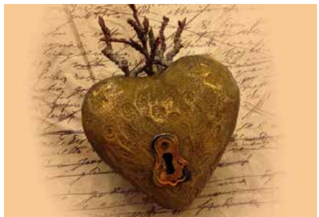
Rusted, gold rub, escutcheon & branches added.