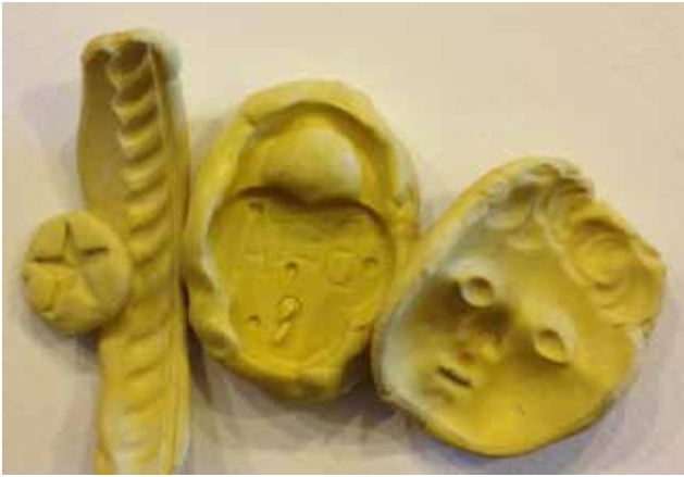
Silicone or push molds are great for casting objects.